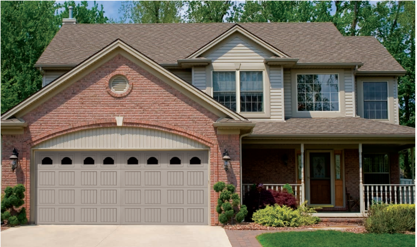
Model 9100 shown in Sonoma design with Cathedral I window inserts